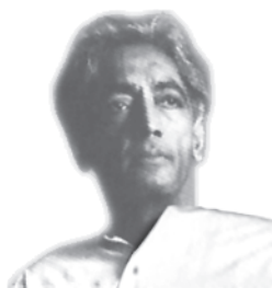
J. Krishnamurti 1895-1986

Jiddu Krishnamurti was a world renowned writer and speaker on fundamental philosophical and spiritual subjects such as the purpose of meditation, human relationships, and how to bring about positive change in global society. His supporters, working through several non-profit foundations, oversee a number of independent schools centred on his views on education, in India, England and the United States. His talks, group and individual discussions, and other writings are published in a variety of formats including print, audio-video as well as online, in many languages.