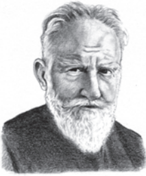
G.B. Shaw 1856-1950

George Bernard Shaw was a dramatist and critic. His work as a London newspaper critic of music and drama resulted in The Quintessence of Ibsenism. His famous plays include Arms and the Man, Candida and Man and Superman. His works present a fearless intellectual criticism, sugar-coated by a pretended lightness of tone. He rebelled against muddled thinking, and sought to puncture hollow pretensions.