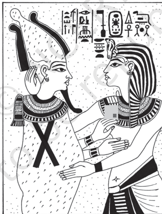
Mural in King Tut's tomb showing King Tut with Osiris, the god of the afterlife

Back in the trailer a technician pulled up astonishing images of Tut on a computer screen. A grey head took shape from a scattering of pixels, and the technician spun and tilted it in every direction. Neck vertebrae appeared as clearly as in an anatomy class. Other images revealed a hand, several views of the rib cage, and a transection of the skull. But for now the pressure was off. Sitting back in his chair, Zahi Hawass smiled, visibly relieved that nothing had gone seriously wrong. "I didn't sleep last night, not for a second," he said. "I was so worried. But now I think I will go and sleep."