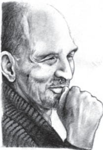
Ingmar Bergman 1918-2007

Ingmar Bergman is a well known Swedish director of films noted for their starkness, their subtle use of black and white and 'shades' of those extremes, the ambiguity of their content, and a certain brooding presence that seems to pervade them all. The list of Bergman films is long; his best known include The Seventh Seal (1957), Wild Strawberries (1958), The Virgin Spring (1960), The Silence (1963), Persona (1967), The Passion of Anna (1970), and Cries and Whispers (1973)—this last film in colour, though emphasising red in all its shadings. In the following selection, the Introduction to Four Screen-plays by Ingmar Bergman (1960), Bergman discusses how he views the art of film-making.