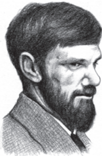
D.H. Lawrence 1885-1930

D.H. Lawrence was born in a coal-mining town. He was the son of an uneducated miner and an ambitious mother who was a teacher. His wife was German, and the couple lived, at various times, in Italy, Germany, Australia, Tahiti and Mexico. Lawrence's writings reflect a revolt against puritanism, mediocrity and the dehumanisation of an industrial society.