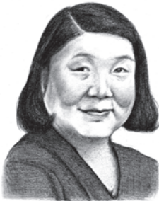
Bi Shu-min Born 1952

Bi Shu-min has been serving her country, China, as a doctor for over twenty years. She also has a Master's degree in literature from the Beijing Teacher's College.